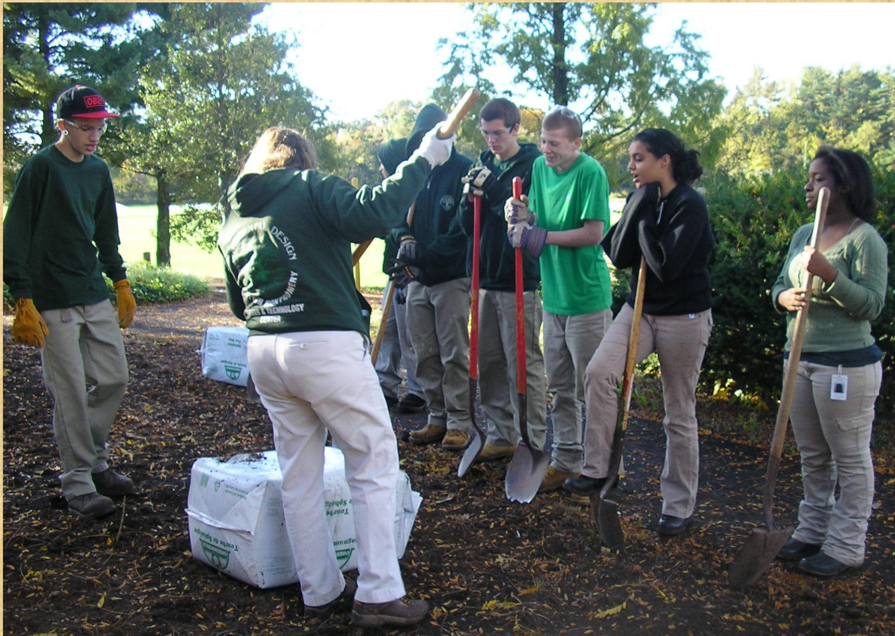
Planting Lesson Before Plant Installation