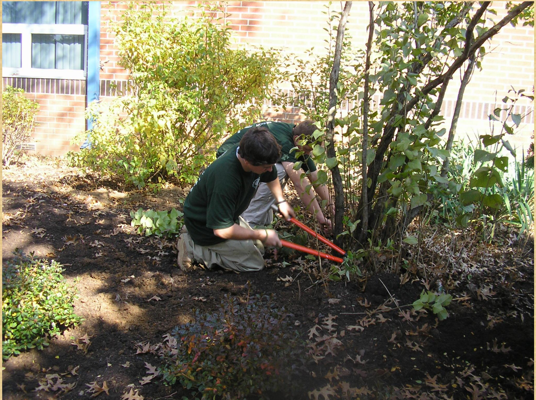
Pruning of existing shrubs and trees