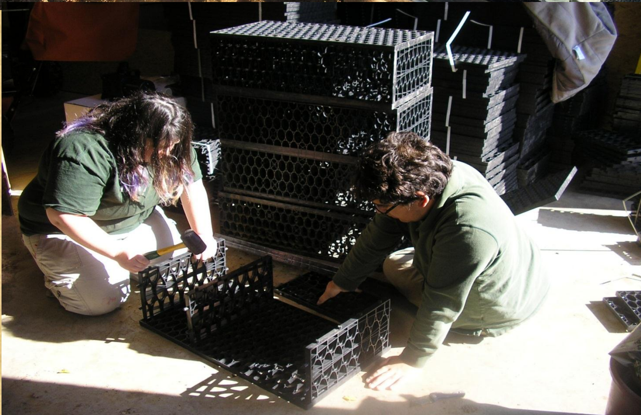
Installation of Bio Boxes