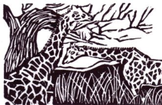
Grace Cieszkowski 7 Black Print