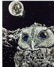
Dylan Dirks 12 Scratchboard