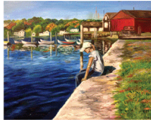
Elime Oehlert 12 Acrylic Painting