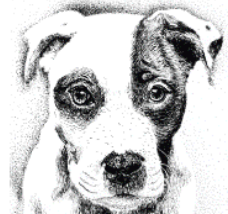
Yeagan Honish 9 Pen & Ink Drawing