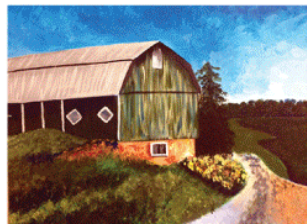
Ellie Grazaidei 12 Acrylic Painting