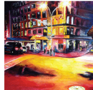
Emily Counts 12 Mixed Media