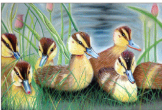
Felicia Falcone 8 Pencil